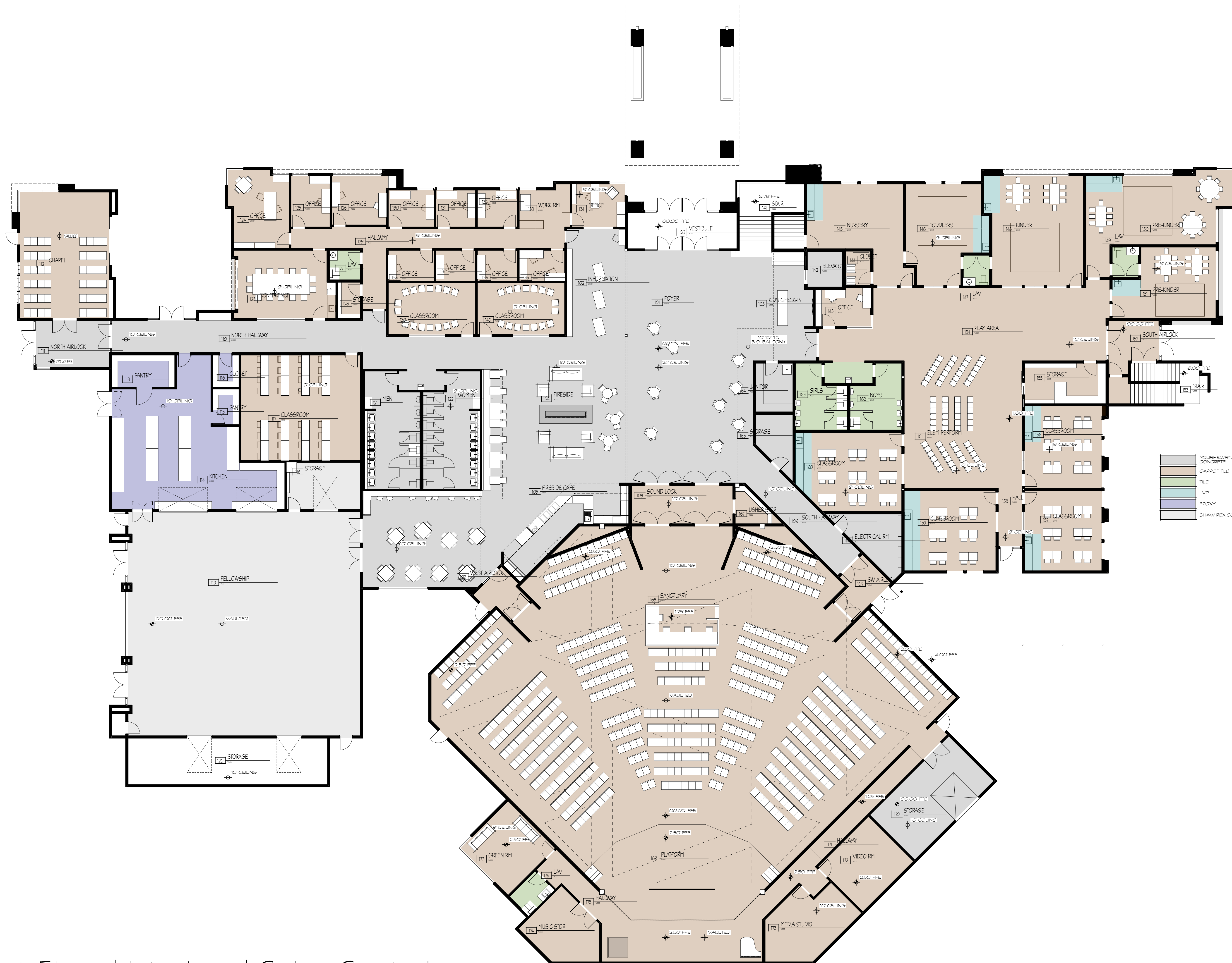
First Floor | Interiors | Color Coated SCALE: 3/32" = 1'-0"

© Arbor South Architecture, PC Northwood Christian Church - 0520